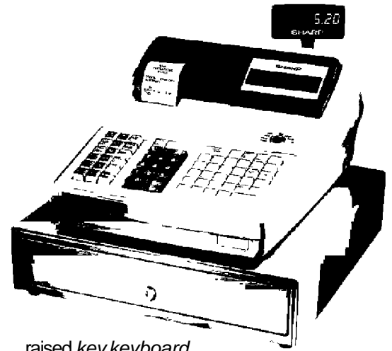
raised key keyboard ER-A520