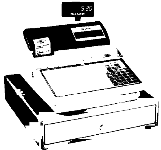
flat, spill-proof keyboard ER-A530

Customizable keyboards to suit your environment